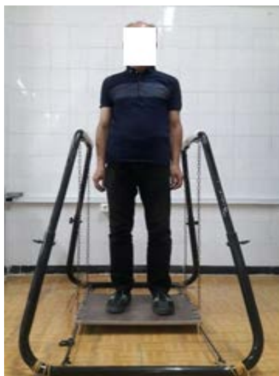
Figure 2. one form of the exercises